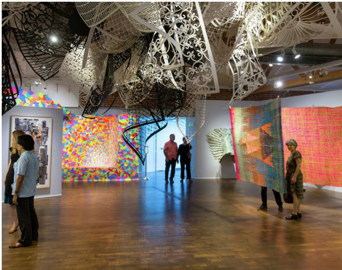
Craft Contemporary Paperworks installation image, September 2015.

Since launching the Fund in March 2020, Getty has been joined by other leading foundations and philanthropists from Southern California and the nation to build the fund to over $30 million. Now, to reach our goal of sustaining at least 70 cornerstone arts nonprofits in our region with two years of operating grants, we seek to raise an additional $10 million from individuals committed to the vitality of arts in our community. The LA Arts Recovery Fund has already made 80 grants to small museums, nonprofit galleries, and visual arts organizations.