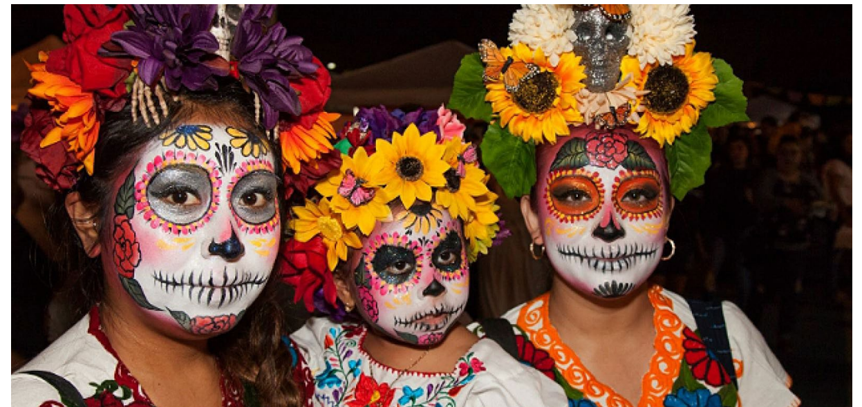
2015 Día de los Muertos, courtesy of Self Help Graphics & Art. Photo: Rafael Cardenas.

In addition to vital financial assistance, grantees will receive technical support from a network of experts. Support will include assistance for navigating reopening under new public-health guidelines, developing online programming, adopting effective governance practices, building successful fundraising plans, and executing adapted business models.